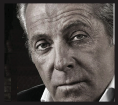
Gianni Russo Actor