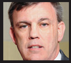
Teddy Atlas Founder - Atlas Foundation